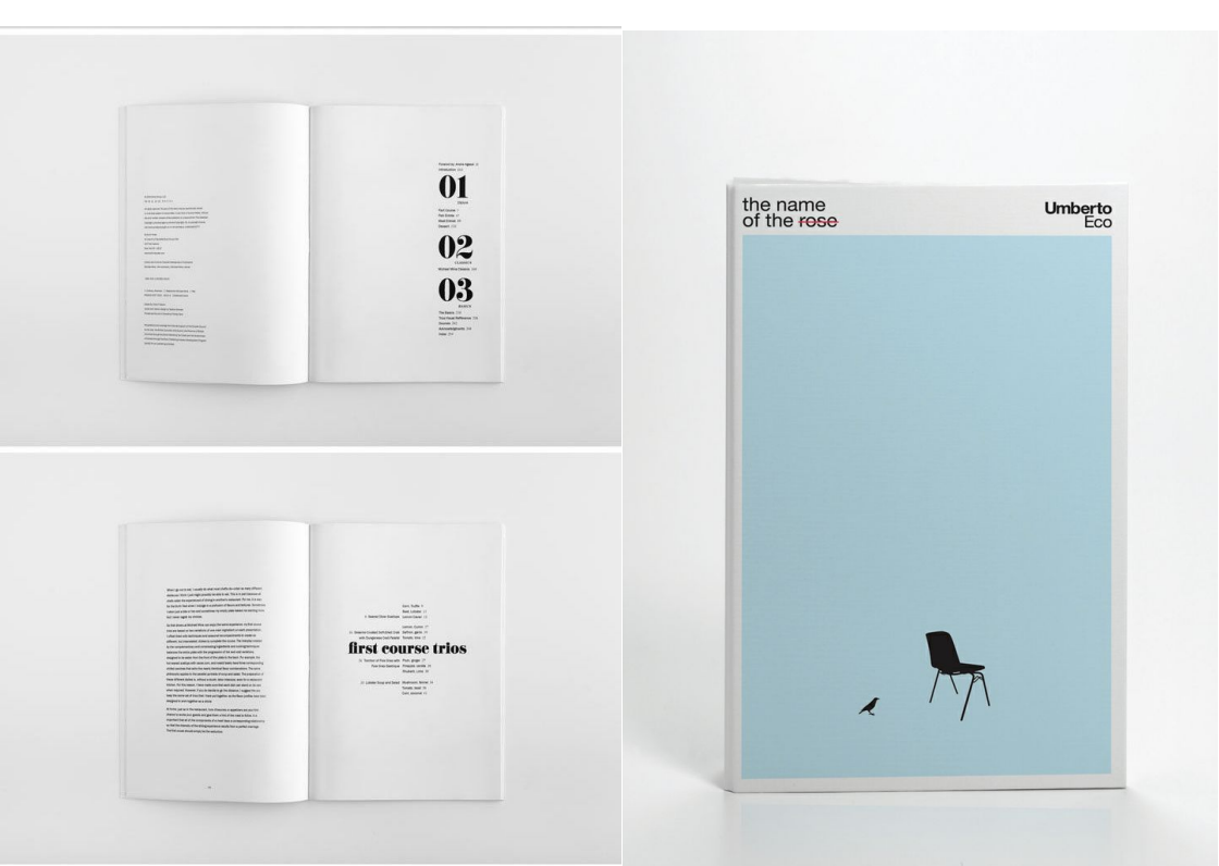
Let me know if you have any questions or anything